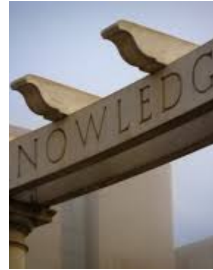
CAMPUS GEN ED RESHAPING