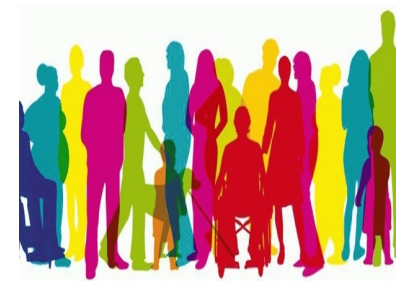
Diversity and Inclusion