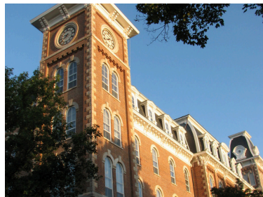
University Resources & Points of Pride